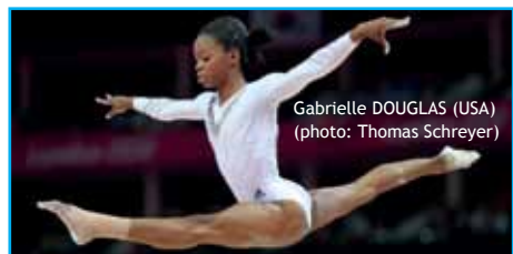
Gabrielle DOUGLAS (USA)