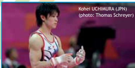
Kohei UCHIMURA (JPN)