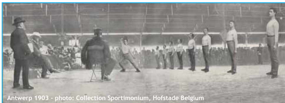
Antwerp 1903